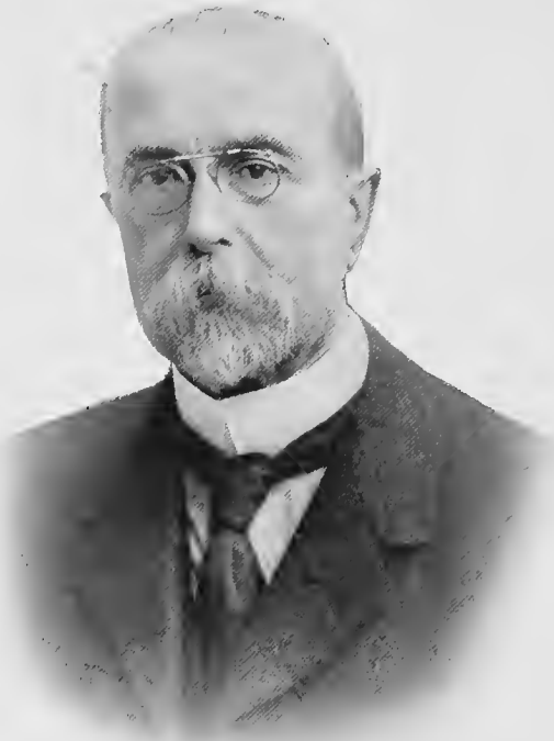
PROFESSOR THOMAS G. MASARYK